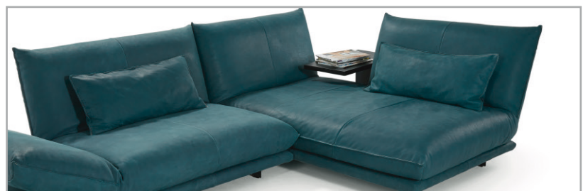
Practical side table to push, optionally available in different woods