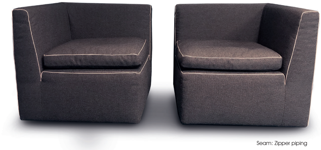
Seam: Zipper piping