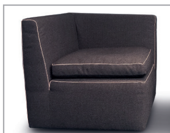
Cosy seating comfort