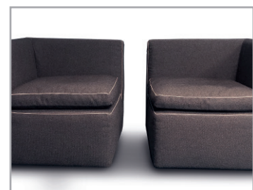
Can be placed as single or 2-seater