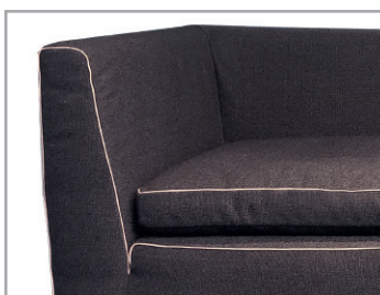
Extravagant decorative seams